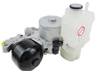
Meat&Doria 805040 Hoffer Products H805040