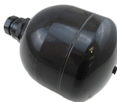
Meat&Doria 805043 Hoffer Products H805043